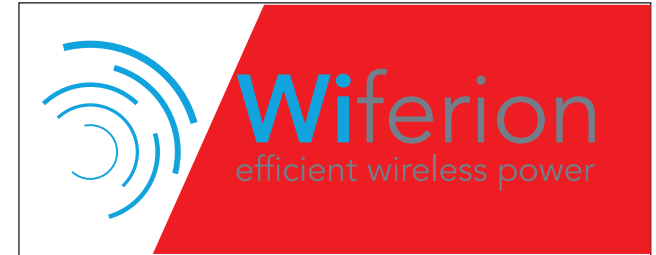
two colored/overlapping background