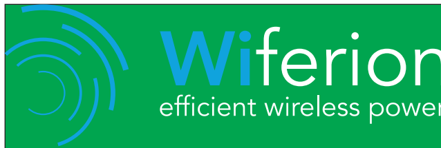
no spaces to border - too big background color doesn't fit