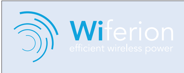
white logo - bright background